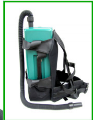
Optional Back Pack Harness